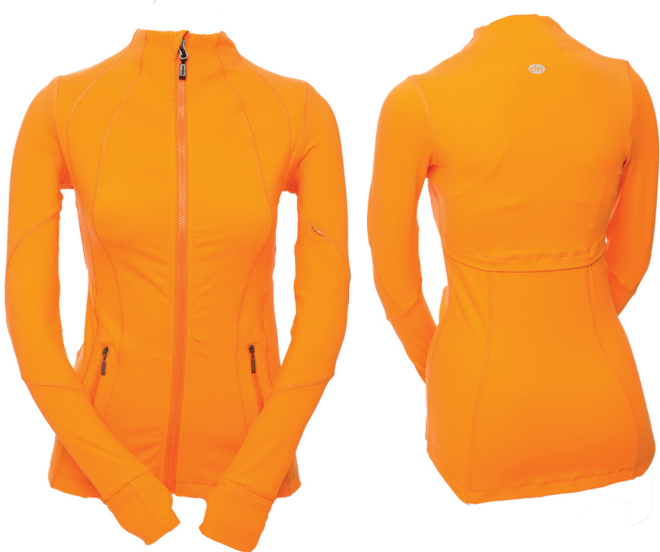
VITA ABITI ORANGE JACKET