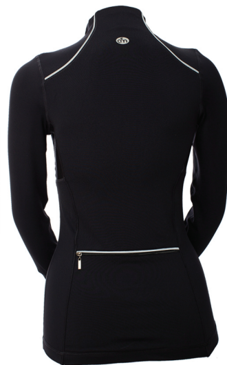
PERFORMANCE BLACK JACKET