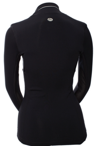
PERFETTO BLACK JACKET