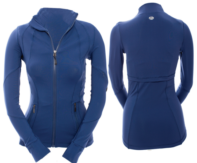
VITA NAVY BLUE JACKET