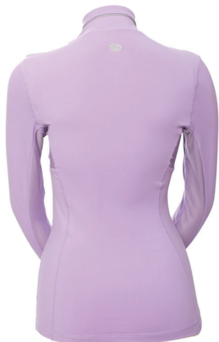
PERFETTO PURPLE JACKET