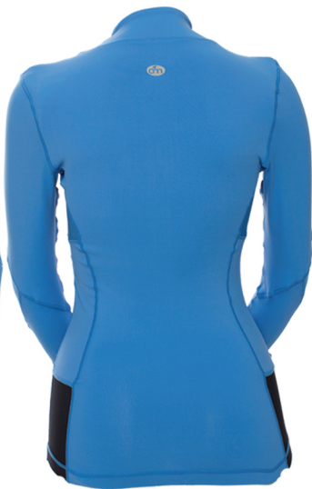
COMFORT SKY BLUE JACKET