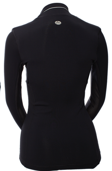
COMFORT BLACK JACKET